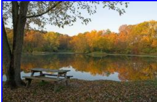
Homer Lake in Homer, IL

Favorite Place of Residents: Homer Lake (pictured below)