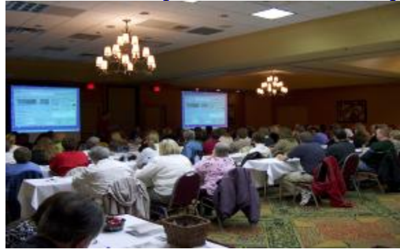
Bolingbrook User Group Meeting

A special thank you to all who attended this year's meeting! We had an excellent turnout with over 100 communities and over 200 attendees. We appreciate all of your constructive feedback and comments, especially pertaining to the upcoming version of LOCIS 7.0. Again, thank you and we hope to see you all next year!